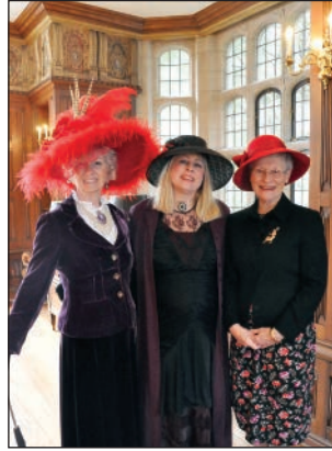
Guests dressed for the Edwardian tea.