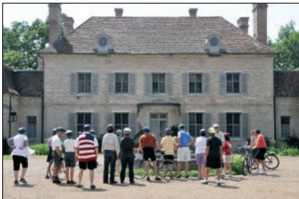
The Lasker Estate bike tour in the courtyard of the estate house.