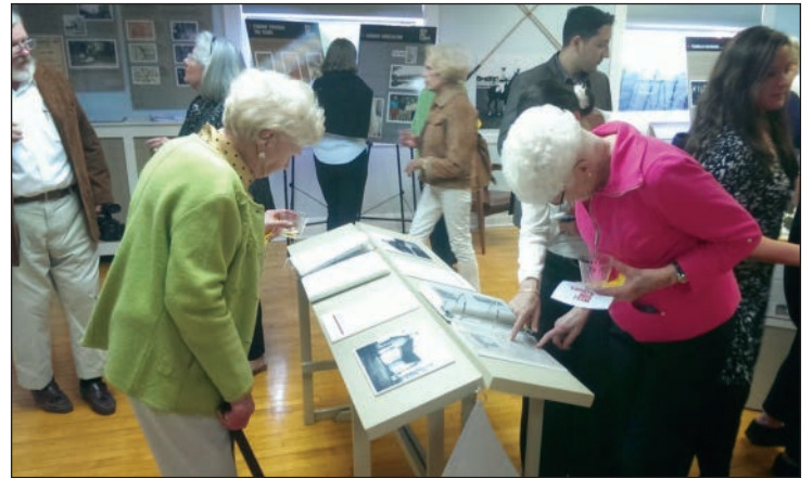
Members' Preview of West Side Stories.