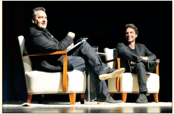
2013 Local Legend Richard Marx (right) and interviewer Roe Conn.