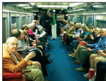
Guests enjoying cocktails aboard Car 553.

One of the most unique programs of the year allowed guests to relive the “Millionaire’s Special” as the private commuter railway car used to be called in the press. The special ride on Car 553 (the only remaining private commuter car in the country) was enhanced with a talk about the history of the car and railroad.