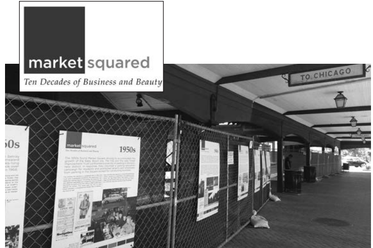
Exhibit celebrates 100 years of Market Square

Our new exhibit, "Market Squared: Ten Decades of Business and Beauty," features panels located in each Market Square shop window and at the East Lake Forest Train Station.