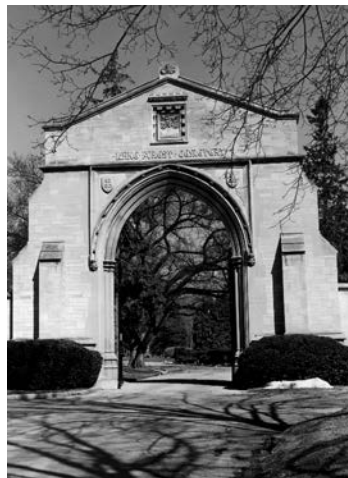
Lake Forest Cemetery